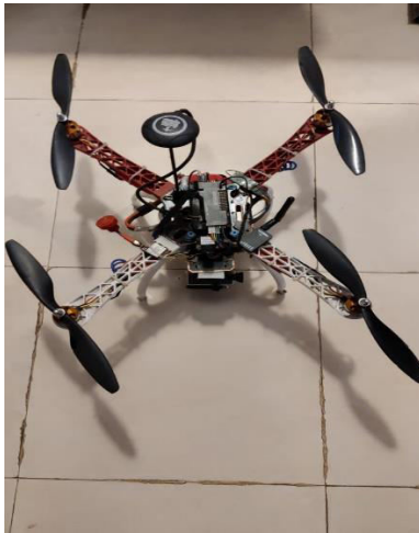
Figure 1: Drone Model